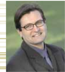
Greg Combet, ACTU Secretary

In Members Equity, we have a financial institution that we are proud to promote as our own, one that builds on the success of the industry super funds and that is committed to providing union members with practical, low cost banking services. Members Equity balances the interests of customers with its shareholders because it is founded on servicing the needs of workers and ordinary Australians.